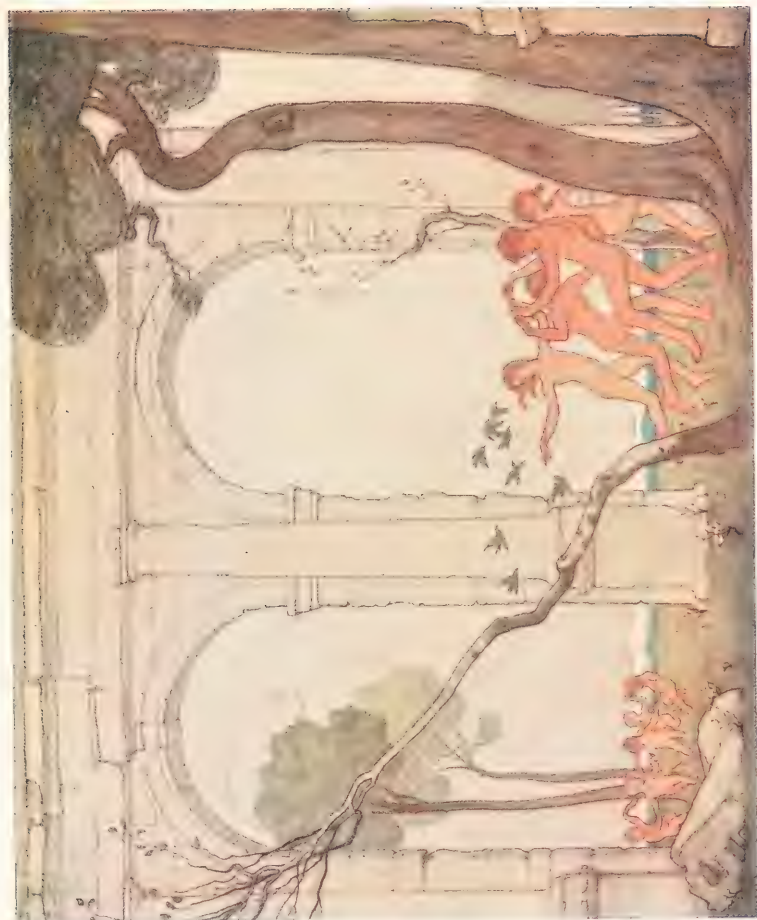
"TRANSFORMATION OF THE PALACE OF LUXURY"